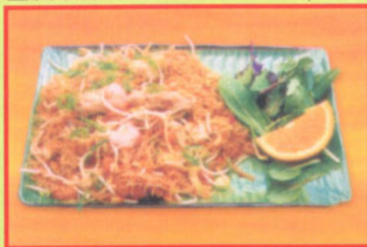
Stir fried vermicelli with meat and shrimp accompanied with salad