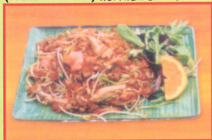
Stir fried rice noodles with meat and bean sprout accompanied with salad