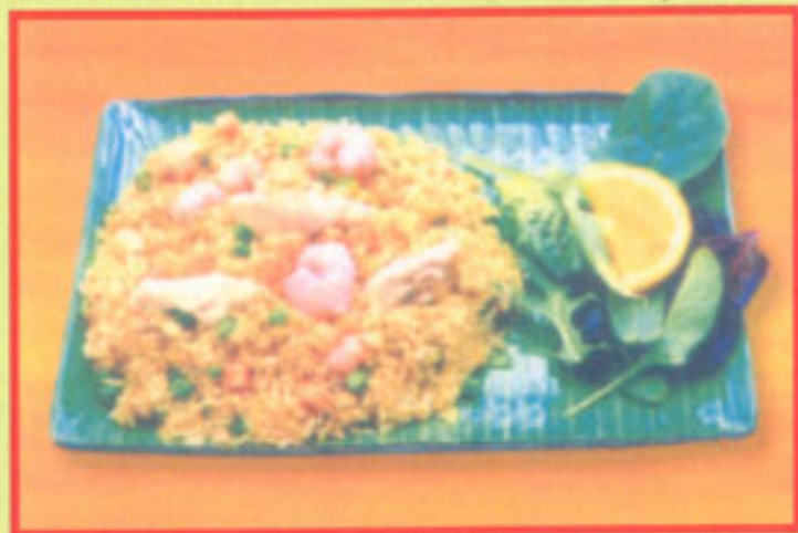
Spicy Malaysian fried rice with chicken and shrimp accompanied with salad.