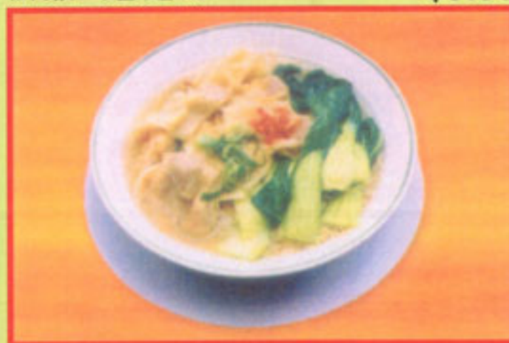
Noodles soup with prawn wonton