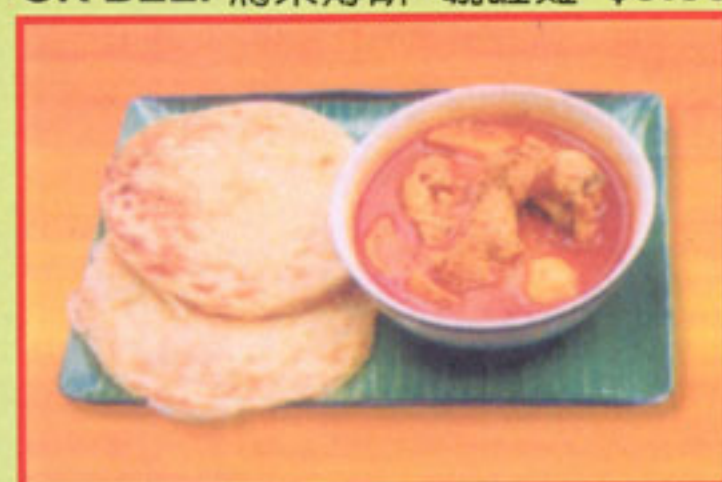
Choice of chicken or beef curry served with Malaysia pancake