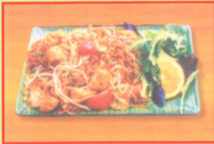
Stir fried egg noodles with meat and shrimp accompanied with salad