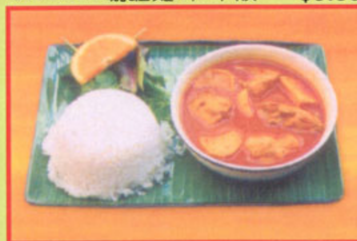
Choice of chicken, beef or creamy lamb curry served with rice accompanied with salad