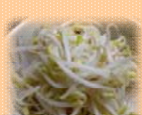
Bean Sprouts $1.50