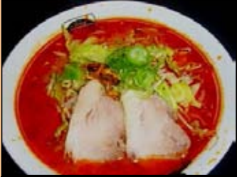
Hot Energy Ramen すたみな らーめん

Ramen with pork and fried vegetables in a spicy miso flavoured soup