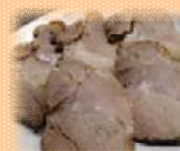
BBQ Pork $4.00