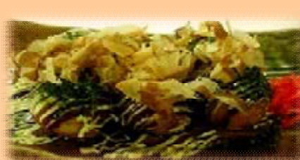
Takoyaki Deep-fried Octopus Balls $6.50