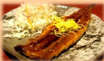
Grilled Eel with Teriyaki Sauce $13.50