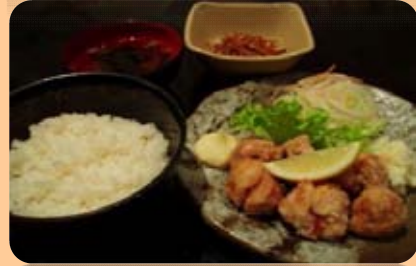
5. Deep-fried Chicken Set $13.00