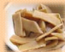
Bamboo Shoots $2.00