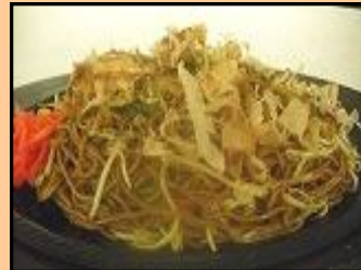
Fried Noodles 焼きそば

Cooked with pork, veges and worcester sauce