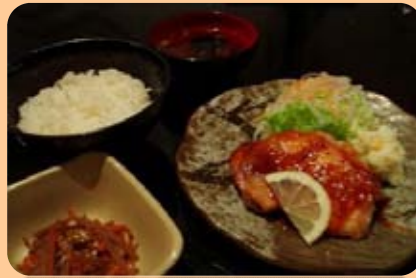
2. Teriyaki Salmon Set $14.00