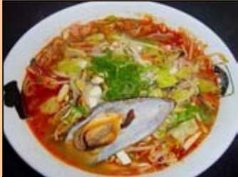
Hot Seafood Ramen ほっと シーふーど