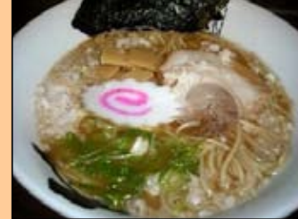
Tonkotsu-Shoyu Ramen 豚骨醤油らーめん

Ramen with BBQ pork, bamboo shoot and seaweed in a pork say sauce flavoured soup