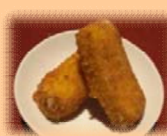
Crumbed Fish Fry $4.00