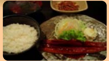
10. Grilled eel Set $18.00