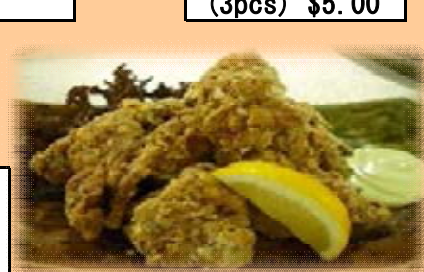
Deep-fried Chicken $8.50