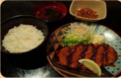
4. Pork Cutlet Set $13.50