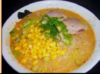
Miso Ramen 味噌らーめん

Ramen with BBQ pork and fried vegetables in Miso (soy bean paste) flavoured soup