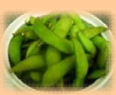
Edamame Boiled Young Soy Beans $4.50