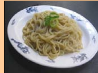
Large Serving Ramen