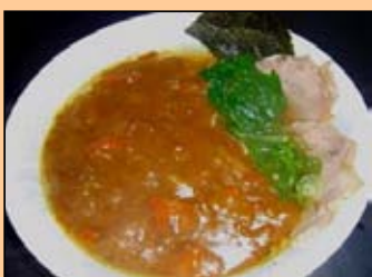
Curry Ramen カレー らーめん