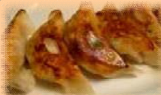
Gyoza (6pcs) Grilled Pork Dumplings $6.50