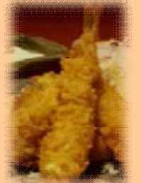
Crumbed Prawns (3pcs) $5.00