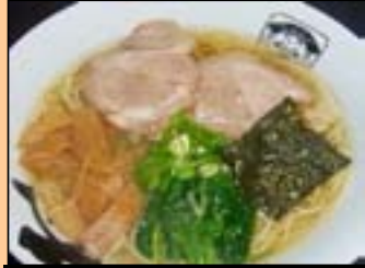
Shio Ramen 塩らーめん

Ramen with BBQ pork, bamboo shoot and seaweed in a chicken flavoured soup