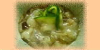
Takowasa Wasabi-flavoured Octopus $5.00