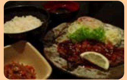
3. Teriyaki Steak Set $14.00