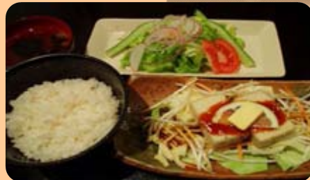
9. Tofu Steak Set (Vegetarian) $12.00