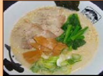
Tonkotsu Ramen 豚骨らーめん

Ramen with BBQ pork, bamboo shoot and seaweed in a pork flavoured soup