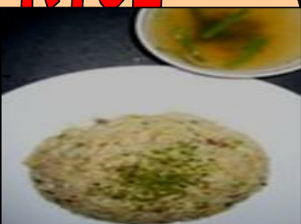
Fried Rice with a bowl of Soup