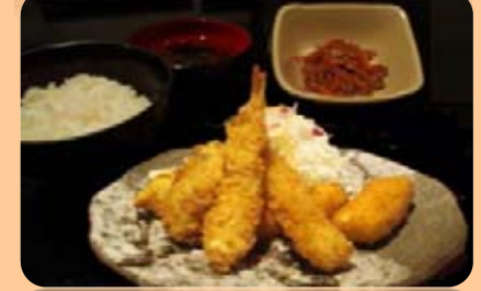
6. Mix Fry Set $14.50 (prawn, oyster, cream croquette)