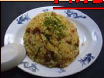
Half Fried Rice with any Ramen order only