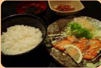
1. Teriyaki Chicken Set $12.50