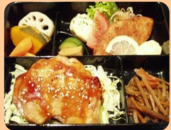
18. Today's Lunch Box $13.50

※The above picture is sample image menu may change daily.