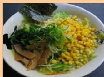
Vegetable Ramen 野菜らーめん

Ramen with boiled vegetables in a chicken flavoured soup