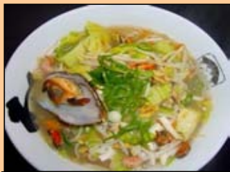
Seafood Ramen シーふーど らーめん