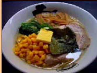
Shio Butter Corn Ramen 塩ばたーこーん らーめん

Shio Ramen with extra toppings of butter and corn