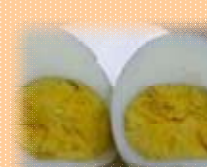
Boiled Egg $1.50